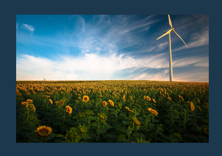
2 - Afternoon